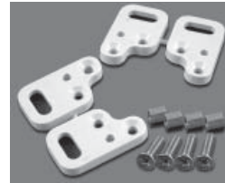
Feet Kit (Part No. 1554FT)